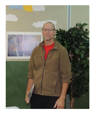
25 Years of Service